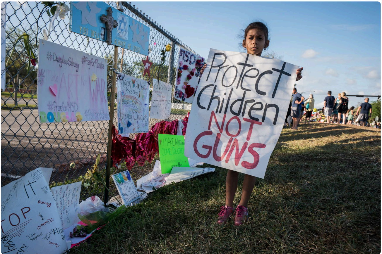
A young school child holds a sign 'Protect Children NOT Guns' at Stoneman Douglas High School, in Parkland, Fla., Feb. 25, 2018.